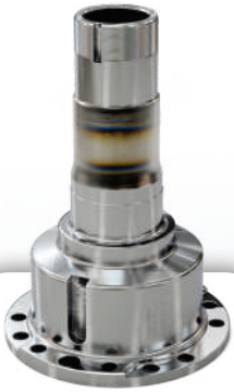
Drive Axle Bolt-On Spindle