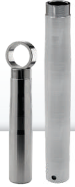
Mack Long and Short Spindles